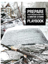
Prepare your Organization for a Winter Storm (FEMA)