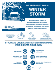
Winter Storm Fact Sheet