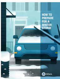
How to Prepare for a Winter Storm (FEMA)