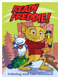
Ready Freddie! An activity book to help kids and families prepare (King County Health Department)

Northwest Healthcare Response Network is a healthcare coalition, which is an affiliation of private and public partners working together to prepare for, respond to and recover from emergencies. Through collaborative planning, training, exercises and coordination of resources, the Network leads a regional effort to build a disaster-resilient healthcare system.