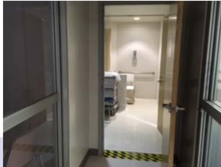
Connected Staff Shower Room