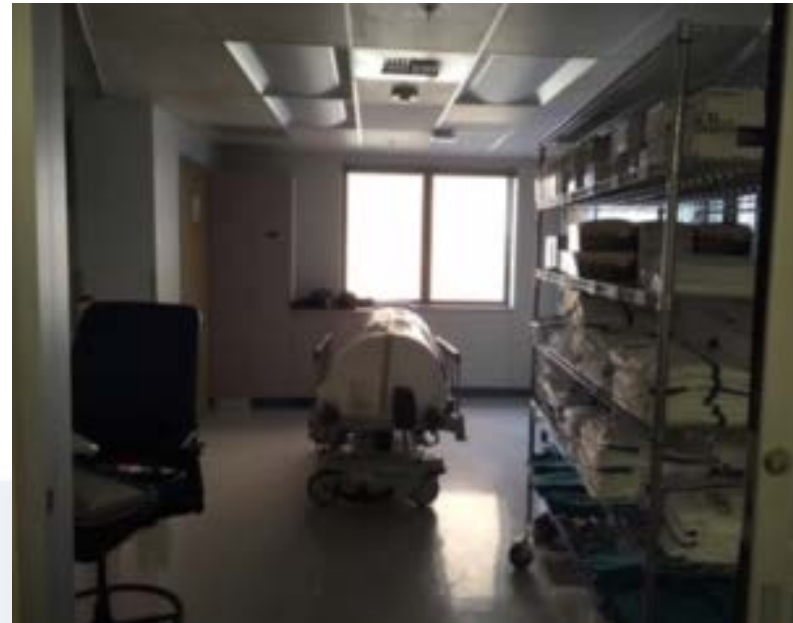
PPE Donning Room/Supply Storage