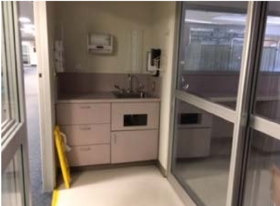
Anteroom/PPE Doffing Area