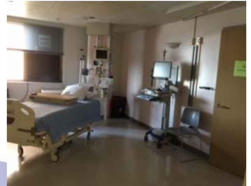
Patient Care Room